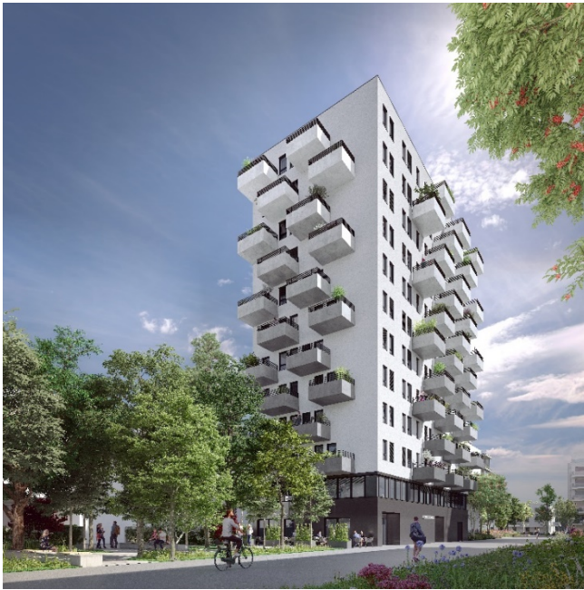
Building 5