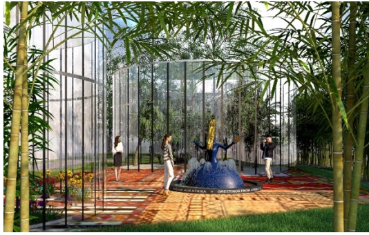
Greeting from Morocco © Büro André Heller