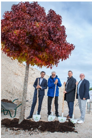
Project launch

https://cloud.sb-gruppe.at/s/G27ZbtSndRfiKL2